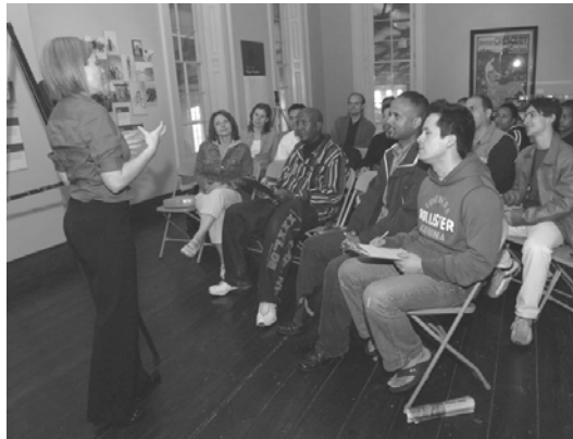
ESL students enjoy a presentation on the history of the market buildings and surrounding neighbourhood

Free. Presentation 20 minutes, presentation and activity sheet 45-60 minutes.