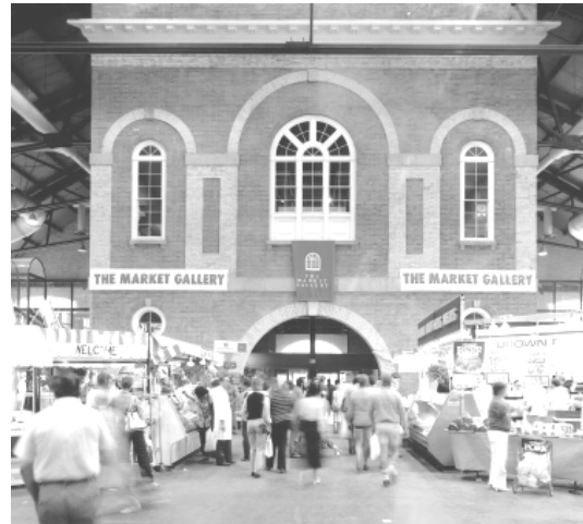
View of Council Chamber (now Market Gallery) from the interior of the South St. Lawrence Market.

3 hours, $3 per student, supervisors are free A lunch break is included in the 3 hours